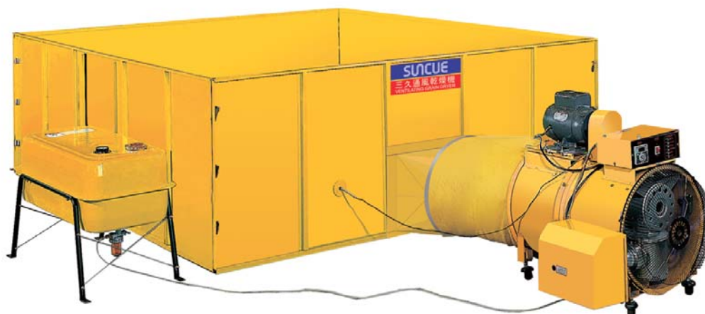
SKS-480G 通風式槍型乾燥機 GUN TYPE (DIRECT) BURNER

乾燥範圍：農產品、食品類、藥草類... 凡需曬乾之物皆適用 Application: Agricultural products, Foods and medical herbs..etc.