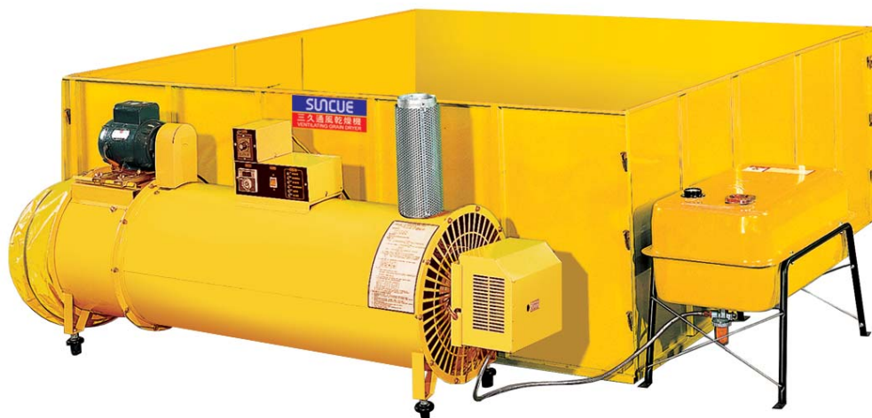
SKS-480C 通風式槍型間接熱風乾燥機 GUN TYPE (INDIRECT) BURNER